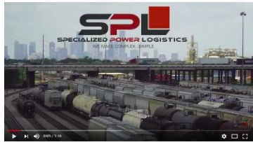
Transformer Delivery Video