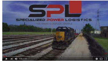
Special Train Video