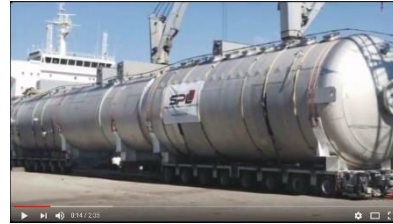
Vessel Delivery Video